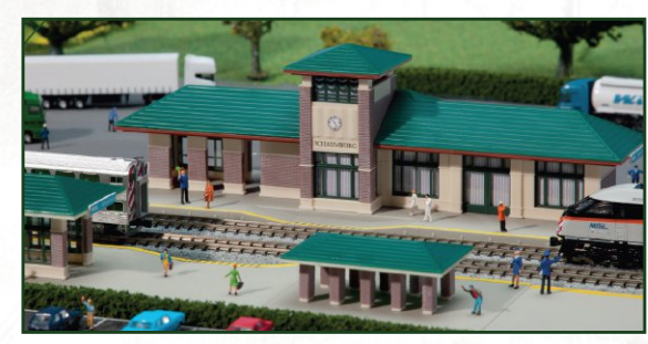
Looking for something unique? Kato's North American Suburban Station Kit brings Metra to life on your layout!